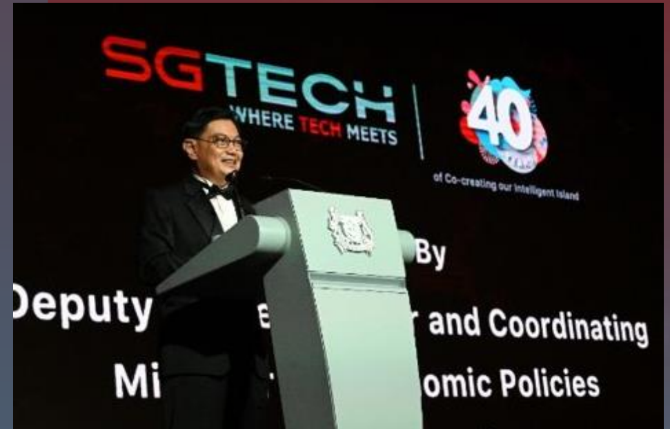
SGTech's 40th Anniversary Gala in 2022 with Deputy Prime Minister Heng Swee Keat as Guest of Honour

SGTech's mission is to catalyse a thriving ecosystem that powers Singapore as a global tech powerhouse.