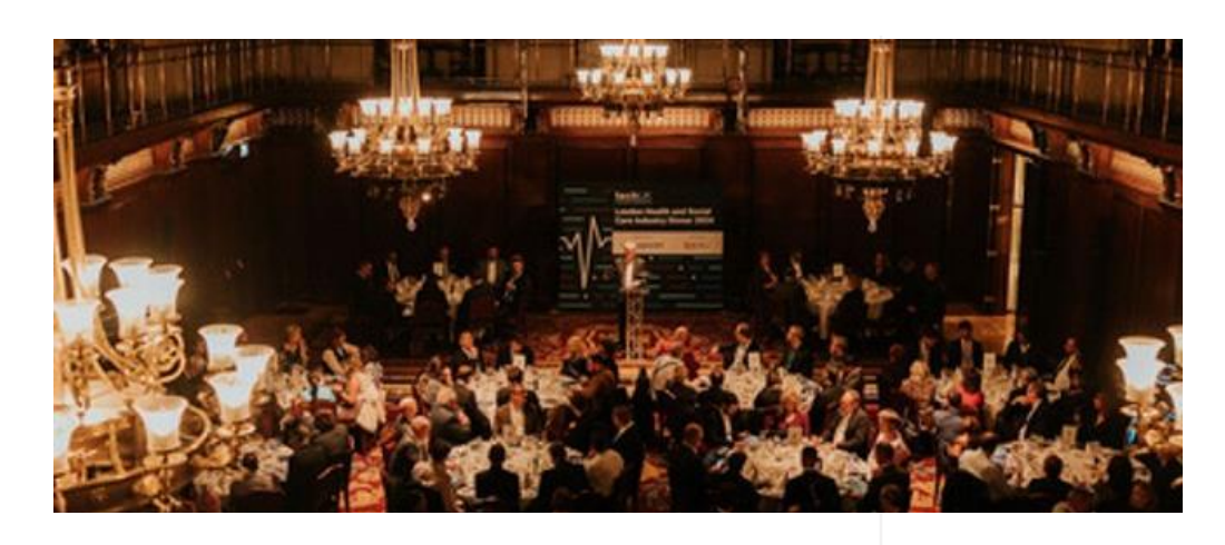
Health and Social Care Industry Dinners

Dinners in Leeds and London provide a forum for industry to come together for an informal dialogue around the realities of digital transformation and technology in health and social care.